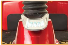
Angle adjustable LED headlight creates a wide path of bright light