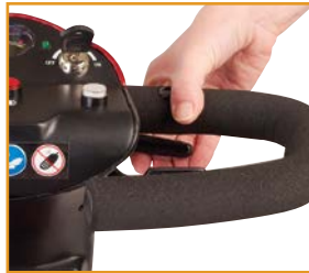
EZ Reach tiller adjustment